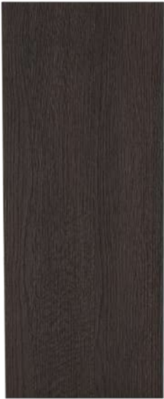
ATLANTA (ASH OAK)