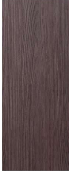
REMBRANDT (CHOCOLATE OAK)