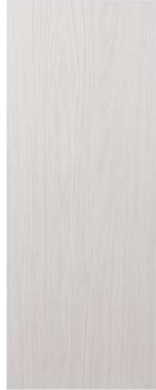
MONET (WHITE OAK)