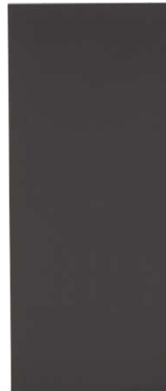
ANTHRACITE (MATT ANTHRACITE GREY)